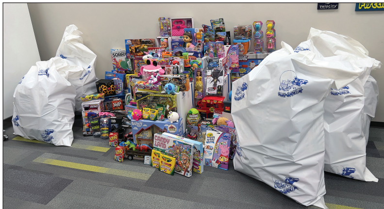
Four big bags of toys and books flank the other donations collected from Velocity employees at our headquarters building.

In addition to toy contributions from employees, financial donations from Velocity and our members through online banking sent $1,500 to Operation Blue Santa and $1000 to Brown Santa of Williamson County.