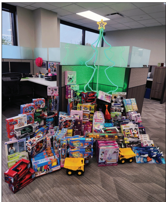
Consumer Lending did more than their part in donating toys for this worthy cause!