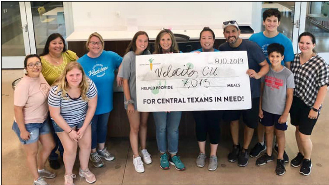
Velocity Credit Union employees and their families gathered at the Central Texas Food Bank and volunteered their time to help Texans in need.