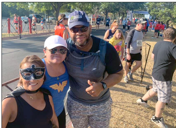
We could be heroes — and we were! Along with scores of other entrants, Velocity employees participated in the annual CASA of Travis County Superhero Run 5k, raising funds to train volunteer advocates for kids.

Velocity employees participated in the race and challenged our