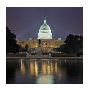
The SECURE Act may have the largest impact on retirement planning since the Pension Protection Act of 2006.