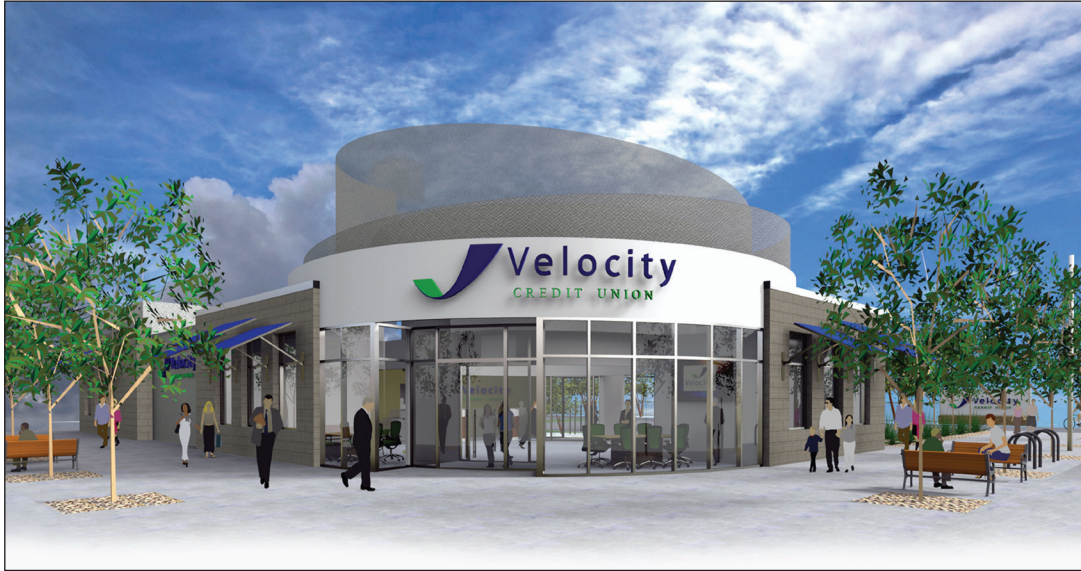
This is a rendering of our new downtown Austin branch, as viewed from the corner of 12th and Sabine Streets. The new facility will be located on the site of our former Annex building, across Sabine Street from our current branch.