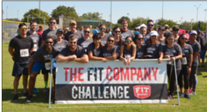
Velocity Credit Union employees recent flexed their muscles at the Fit Company Challenge.

Austin returns to Republic Square Park on October 29. Benefiting AIDS Services of Austin and 10 sharing agencies, this event brings together people (and pets) from all walks of life.